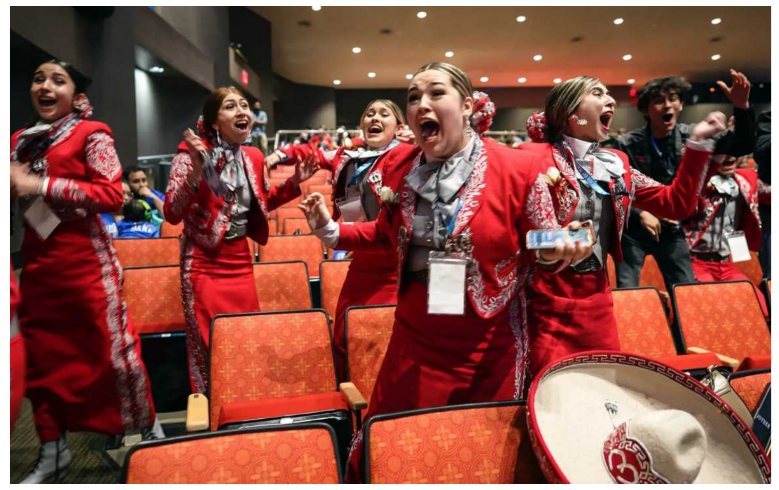
Members of Mariachi Cascabel reacting to their victory at the 2021 Mariachi Vargas Extravaganza — a win that bestows bragging rights as national mariachi champions.

"But this time," he said, "we decided between the three of us that first place is for — Mariachi Cascabel!"