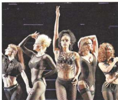
The Tony Award-winning musical Chicago comes to the Majestic Theatre Dec. 12-17.