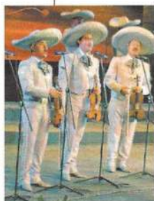
The world-famous Mariachi Vargas de Tecalitlán performs in San Antonio December 2.

Two performances are scheduled: 3 p.m. and 8 p.m. AT&T Center, One AT&T Center Parkway. 224-9600.